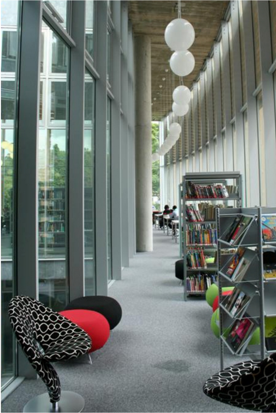
Mullingar Library, Westmeath County Council