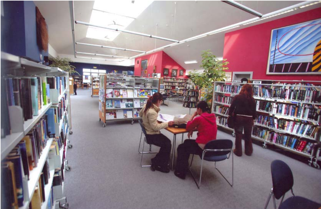
Listowel Library, Kerry County Council