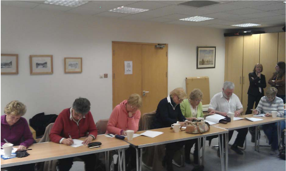
Older People, Co Kildare