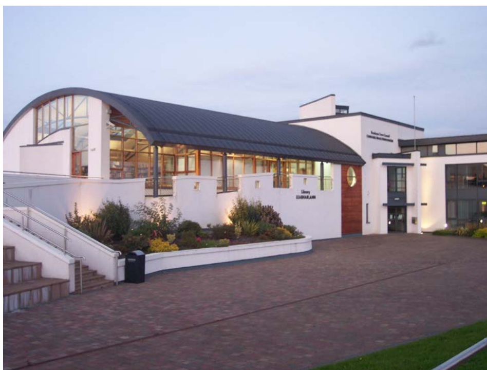
Bundoran Library, Donegal County Council

Public Libraries are champions of Irish language and culture. In line with the 20 Year Strategy for the Irish Language 2010-2030 20 , libraries work with Irish language agencies and educational bodies towards creating online language learning resources to support increased emphasis on oral and aural skills in the curriculum. As in other EU countries, ebooks through the national language are generally made available through the public library network, encouraging and facilitating learning and enjoyment of the national language.