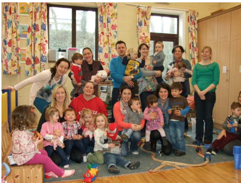
Parents of Young Children, Limerick City

"It became apparent also that if their local libraries were to offer more in the line of activities, that they would certainly attend them, as many of the parents would welcome more opportunities to visit the library and interact with other parents whilst there."