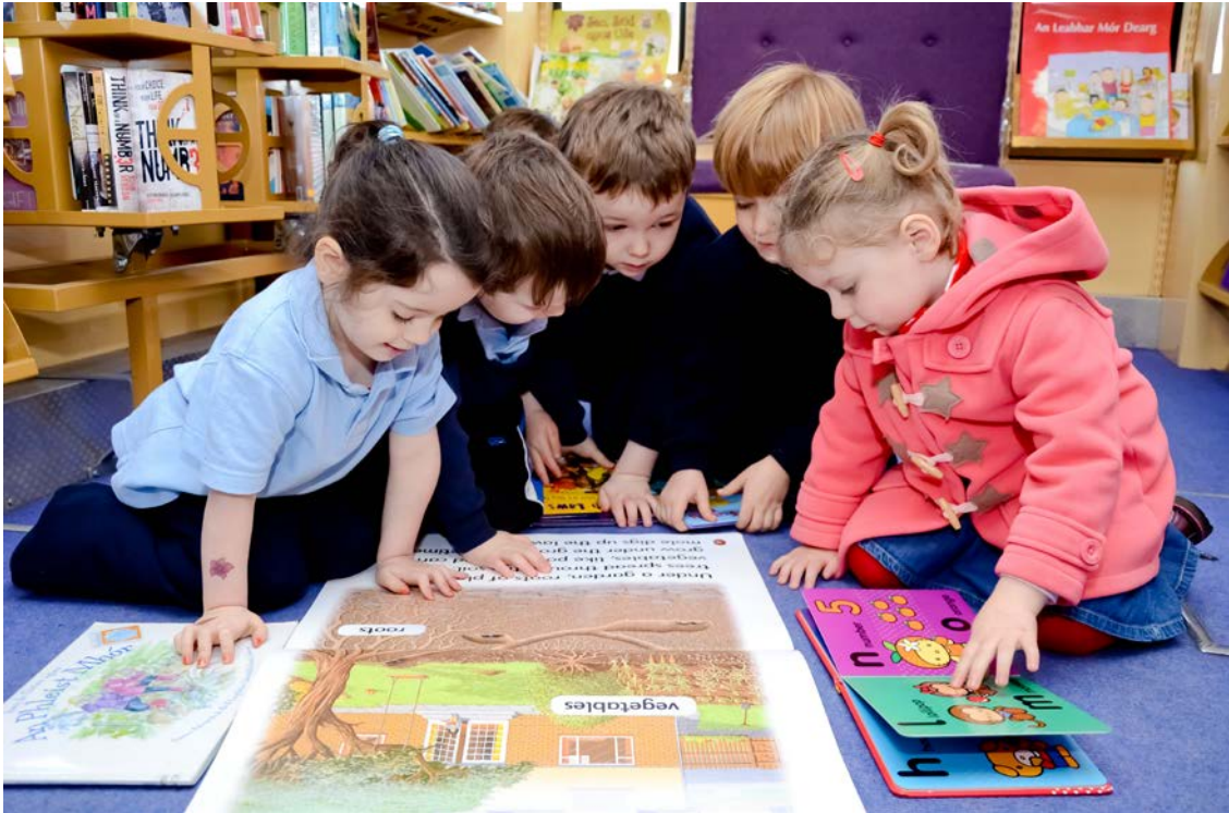
Mobile Library, Roscommon County Council