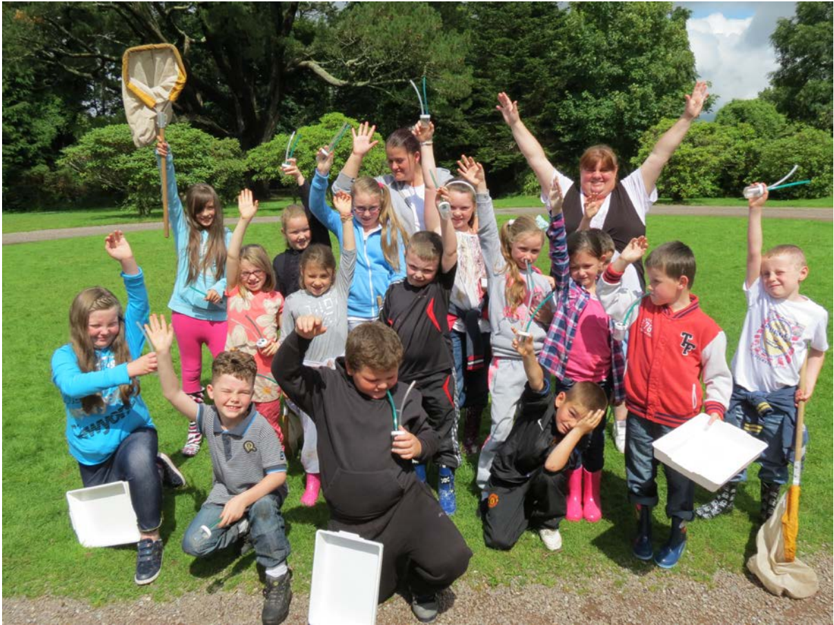
A focus group was held with members of the West End Youth Centre, Limerick City