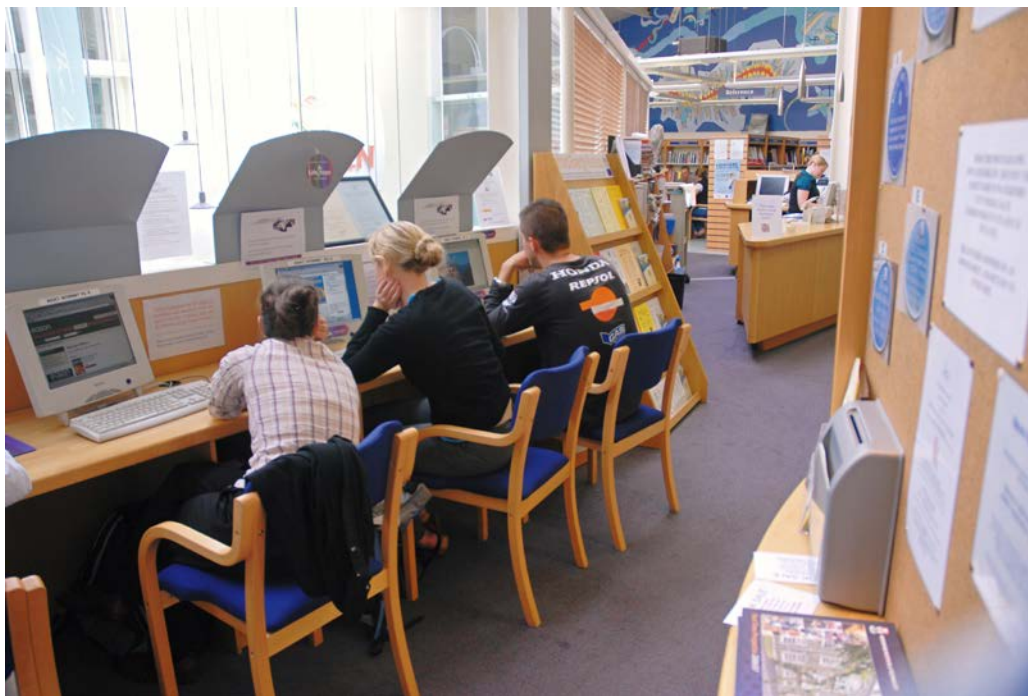
Arkeen Library, Waterford City Council