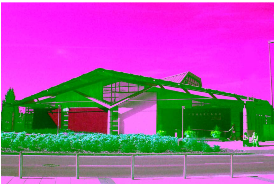
Dooradoyle Library, Limerick County Council

The public library network is particularly well placed to engage with shared service delivery and collaborative models through its physical and virtual library network. Co-operation and sharing are cornerstones of effective library provision. By building relationships and synergies within the local authority structure and across local authorities, the library service can provide more cohesive and cost-effective services to the public. Strategic direction identifies new shared approaches in the context of local government reform and shared services.