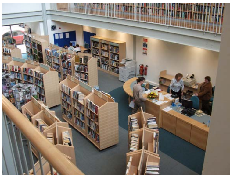
Ballinamore Library, Leitrim County Council

The library has a responsibility to collect and make available local community and cultural information to ensure that content rarely collated elsewhere can be accessed in the public library.