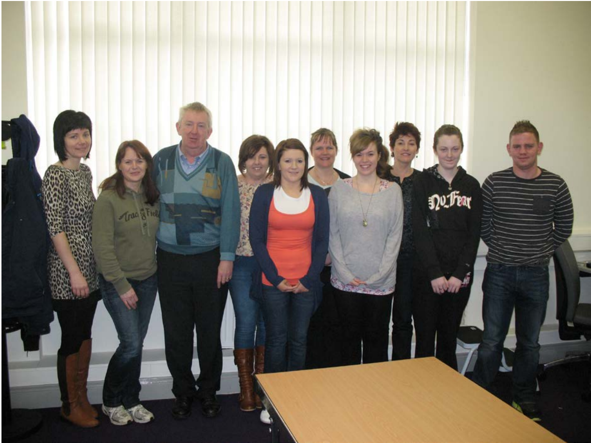
Adult Learners, Co Donegal