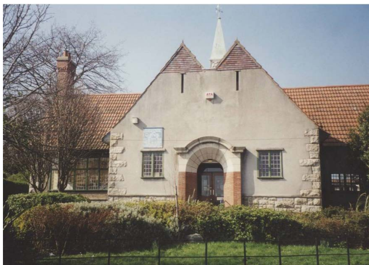
Shankill Library, Dun Laoghaire-Rathdown County Council

The reviews of the 1950s resulted in the Public Library Grants Scheme, initiated in 1961 by the Minister for Local Government. This provided a 50% subsidy on loans raised by local authorities to fund new public libraries. Grant aid was made available on a case by case basis, rather than forming part of a strategic, planned programme. This resulted in an uneven take up of grant aid and the inconsistent development of the library service across the country. Consequently, when the Minister initiated the next review in 1985-6, it found that while there had been substantial improvements in the service since the introduction of funding in 1961, there was a low level of exploitation arising from a lack of national commitment to the service and a lack of clear understanding of what constitutes a modern library service, and in particular, its function in the field of information 8 .