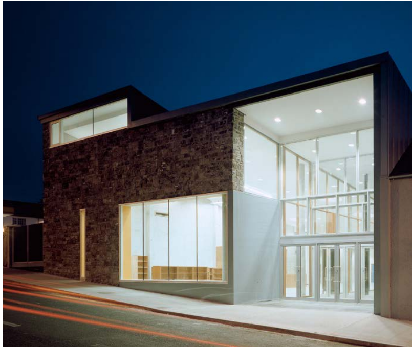
Tubbercurry Library, Sligo County Council

transferred to Libraries Development, a new division of the LGMA.