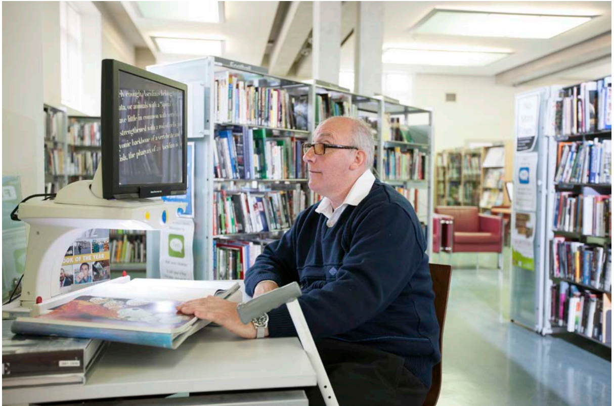
Johnston Central Library, Cavan County Council