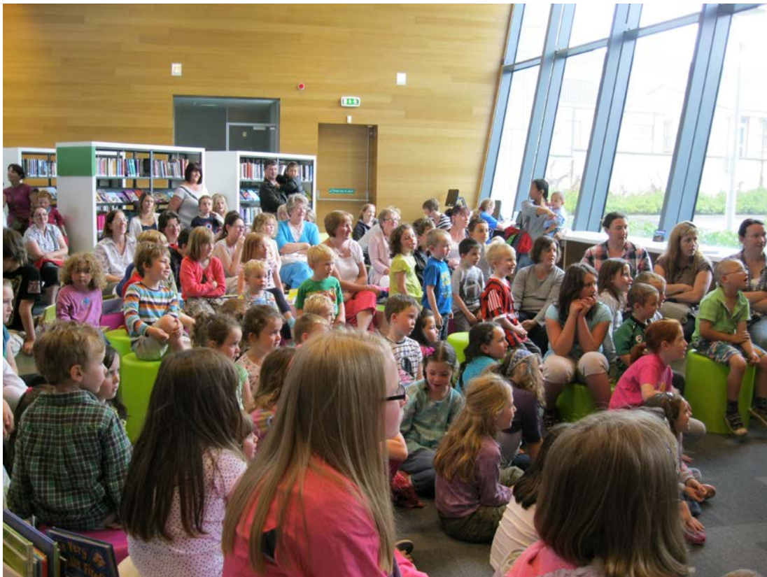
Summer Reading Challenge programme at Gorey Library, Wexford County Council

The modern public library is a vibrant, busy, colourful, attractive place where families can enjoy a range of activities and events. The library promotes intergenerational interaction in a safe, democratic community facility which supports social cohesion and inclusion.