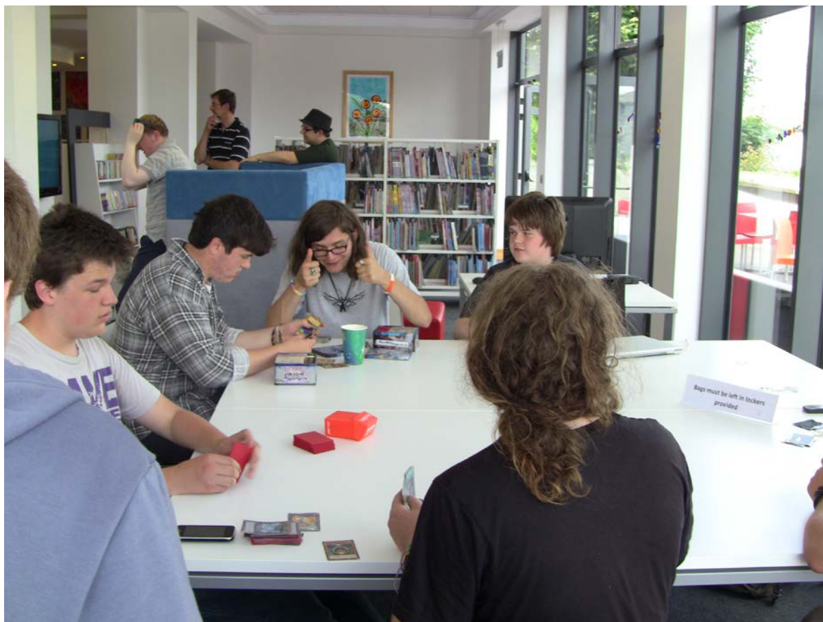
Teenage board games at Tullamore Library, Offaly County Council

Libraries are an open and free communications centre with news, local history, wifi and /or terminals to access the internet. A family place, community hub, business centre, a place with which the whole community identifies.