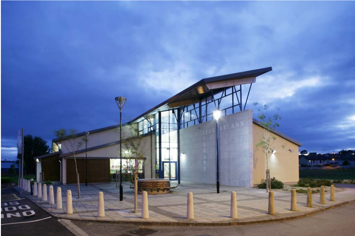
Westside Library, Galway City Council, opened January 2004

the basis of maximising the potential for public libraries to make major contributions to Government objectives, particularly in the areas of the information and knowledge society and social and economic inclusion.